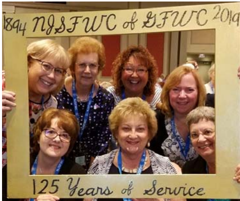
CONVENTION 2019. More pics next month!

Thank you so much for your support to help the homeless in our community!